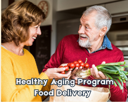
Healthy Aging Program Food Delivery

Exciting news! Our Healthy Aging Program now delivers delicious, balanced meals to seniors' homes in Ottawa and Gatineau!